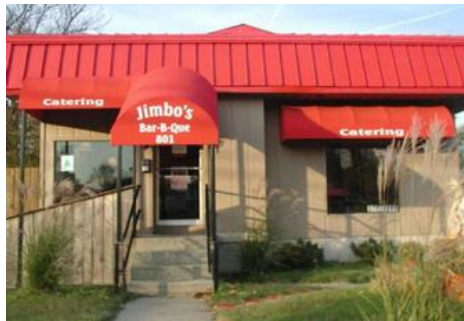
Jimbo's is located next to Republic Bank on Kenwood Dr.

Jimbo's menu includes pulled meats, salads and wings, ribs and chicken, all with your choice of regular or spicy secret recipe bar-b-que sauce. Their seasonal favorite, fried green tomatoes, will whet